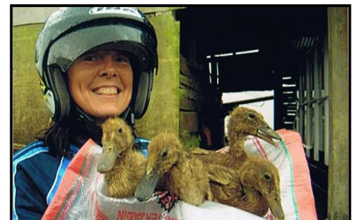
Delivering Duckings to Poor Families