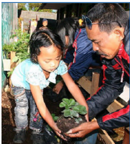
Helping to plant a school garden

“The children were very excited to build the garden and plant it. They were so friendly and happy and eager to learn English words for things as we went along. They were a really nice balance between being silly and fun-loving but then when something was being explained they were instantly attentive and respectful.”